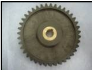
SBI Picker LH Gear w/ Brass Insert